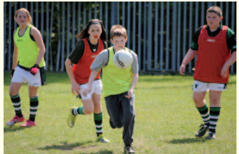
It's all go on the Easter GAA Camps 2011...

and effort to put in place but well worth it and very well received by all who view it.