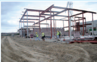
Up she goes... No stopping now as the building frame is erected for the new clubhouse