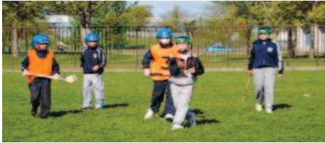
Getting to grips... Action from the ASH (After School Hurling programme) in Scoil Fhursa

Following up from last year's after school programme PAL – Play And Learn came a new initiative titled ASH – After School Hurling.