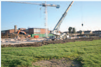
Foundations going in to the new development