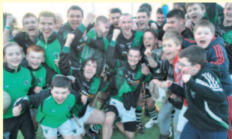
U 21 Hurlers win championship 'B' final