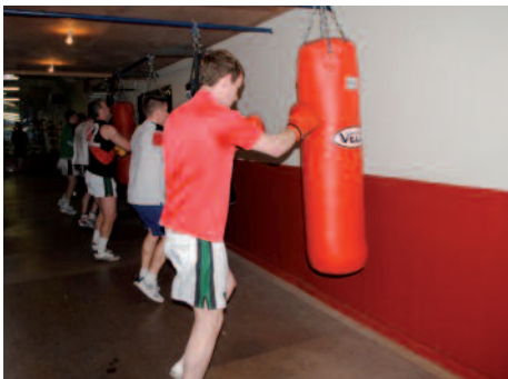
1-2; 1-2...Lads put in the work for Docklands Boxing matches