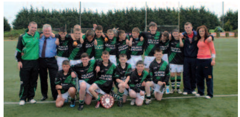
All smiles... Coláiste Dhúlaigh win the Tom Quinlan Shield