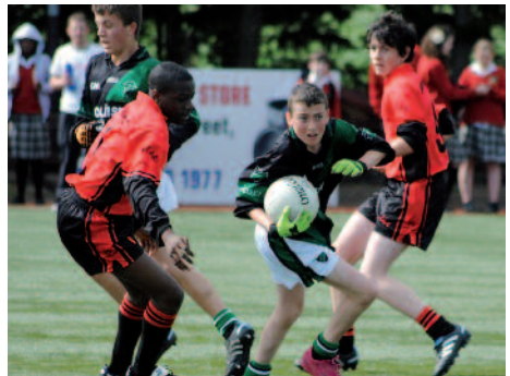
Action... Coláiste Dhúlaigh march on to victory in the First year Tom Quinlan Shield